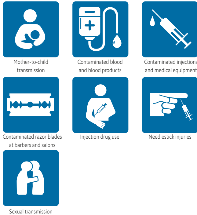
Figure 1: How is hepatitis B and C transmitted?