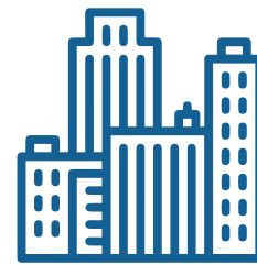
Specialist doctors are concentrated in cities

where there is the opportunity for infections to be detected early. In parts of northern Nigeria where there are areas dealing with conflict, this further impacts the success of advocacy, screening and immunisation programmes. 5 Organisations such as the Society of Family Health (SFH) in Nigeria recognise the importance of bringing health closer to individuals and their homes to improve access to, and uptake of, essential health information and services. For example, SFH supports the Nigerian government with service delivery by utilising primary health care facilities and social franchising networks comprising private and faith-based hospitals. 6